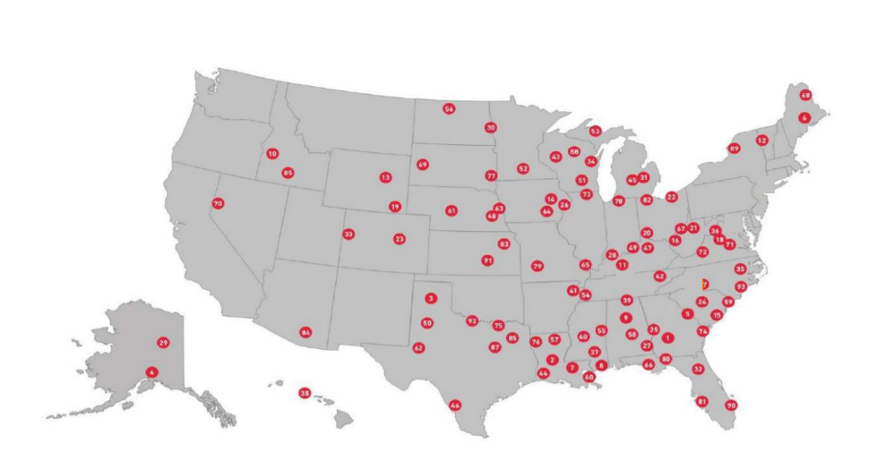
Total Gray Television Markets Served <sup>1</sup>